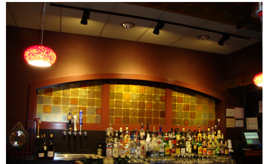
Sushi and Raw Bar