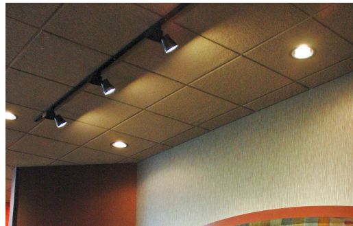
Imperial Wok Restaurant

Attractive, compact and extremely energy efficient accent lighting solution creating crisp white light enhancing your merchandise's appearance. Bring out the bright, natural colors of your perishables. Fully adjustable lighting that's always right on target – even if you rearrange your merchandising layout. Improve your bottom line and reduce your carbon footprint with Energy Focus' LED lighting solutions.